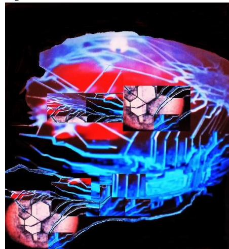
[Dendritic Cell in communication with sensitive fabric and with Endorphins]