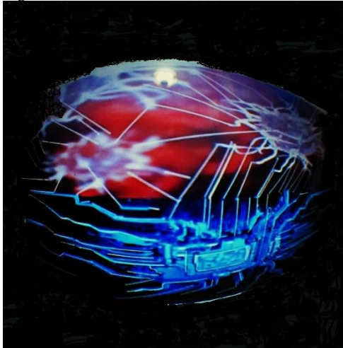
[Dendritic cell in communication with sensitive fabric.]